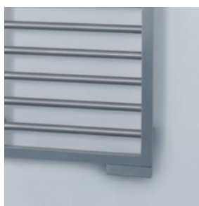
Simple and Radio Frequency