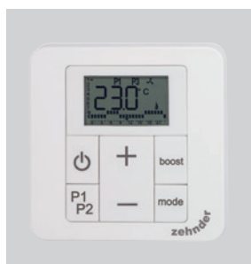
Electric Option Radio frequency remote programmer, see page 115.